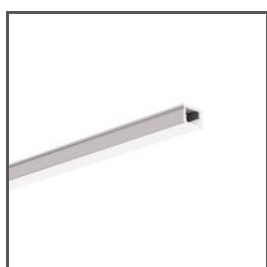
PIKO A08288 Ref. arch B8288