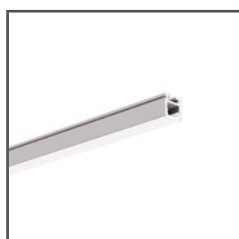
PIKO-ZM A01168 Ref. arch C1168